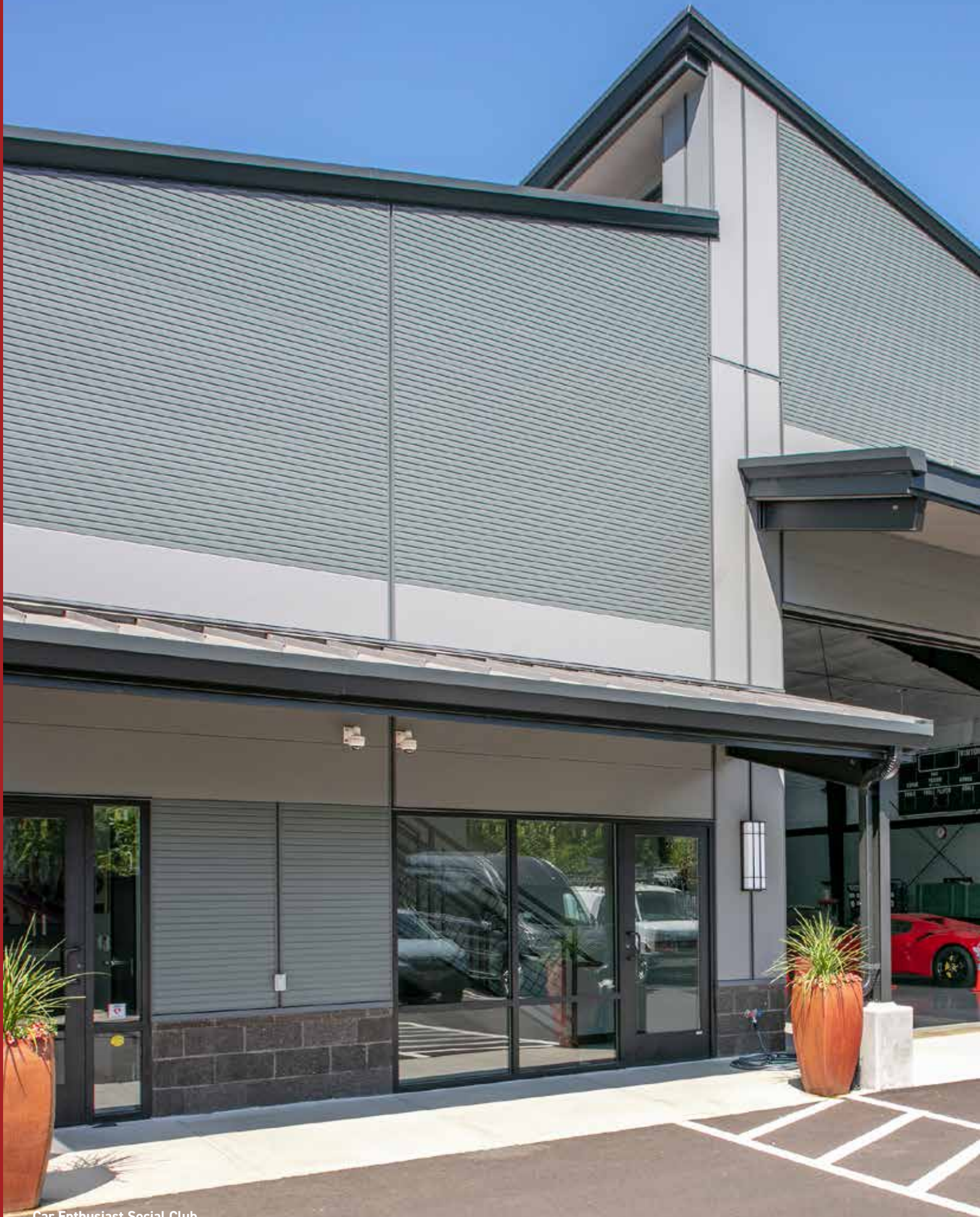
Car Enthusiast Social Club